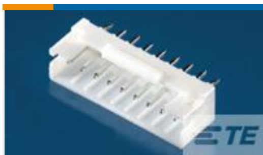
TE Part # 1-1735446-3 2MM PITCH HPI POST HEADER, VERTICAL, 13P